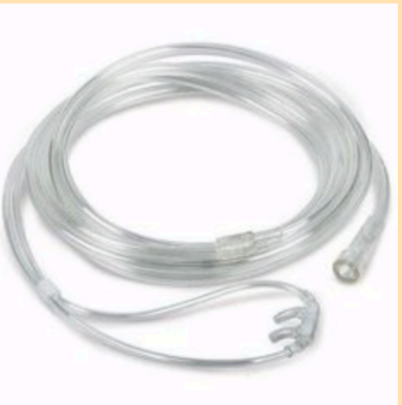
Low Flow Nasal Cannula